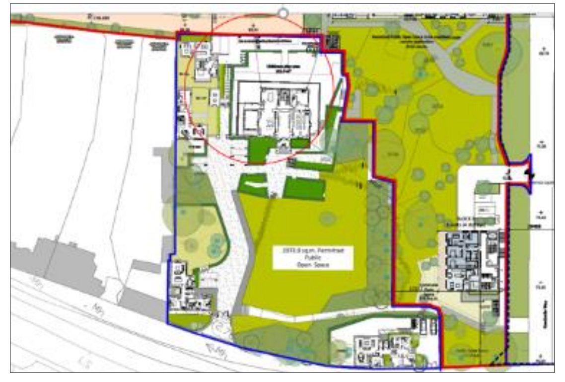
Figure 1.2: Extract from Proposed Site Layout Plan, showing childcare facility permitted under Reg. Ref. D17A/1124.

As the proposed development (Phase 1 and Phase 2) comprises 262 No. dwelling units which can reasonably accommodate families (i.e., 2-bedrooms or more with respect to the relevant guidance), we submit that a purpose-built childcare facility is required at this location with provision for 70 No. childcare places. We note that a 400 sq. m childcare facility was previously permitted under Reg. Ref. D17A/1124 with sufficient capacity to absorb the childcare demand of the entire development once completed (see Figure 1.2).