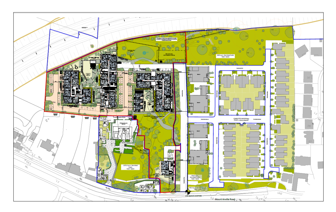
Figure 1.1: Proposed Site Layout Plan, showing relationship of proposed Phase 2 development (outlined in red) to previously permitted Phase 1 development.

The proposed development will consist of the amendment of the permitted 'Phase 2' residential development of 93 no. units, childcare facility and community/leisure uses (DLRCC Reg. Ref. D17A/1124) on a site of 2.75ha. The proposed development will provide for the reconfiguration and redesign of the approved residential development. The Knockrabo Way entrance road (constructed and unconstructed), the renovation of Cedar Mount House including childcare facility and community/leisure uses, the Coach House, Gate Lodge (West), the Gate House and all associated landscaping permitted under D17A/1124 which are outside the boundary of the current application are proposed to remain as previously granted. See Appendix A for a full description of development.